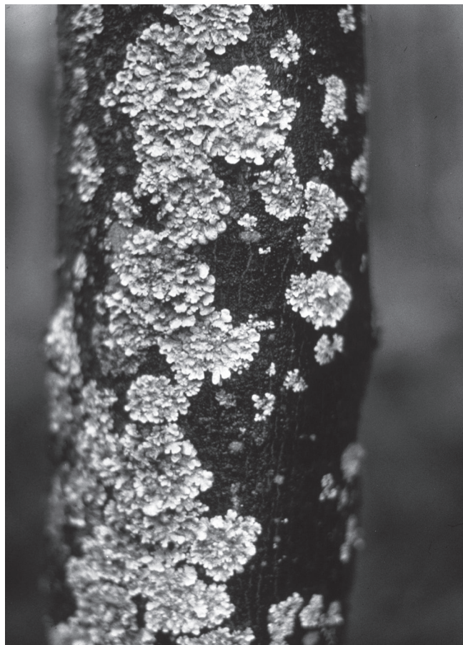
Trees help support many other living organisms, including these lichens. Far from harming the tree, lichens indicate pollution-free air.

For each tree and direction, record the number of circles that show lichens. This number represents the percentage of lichen coverage.